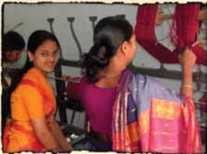
A Salvation Army program in Bangladesh helps women develop the work skills necessary to prevent them from being trafficked, or to help restore the lives of those already trafficked.

The sex industry in the Netherlands is estimated to make almost $1 billion each year. (UNECE, 2004) It is a major Western European destination country for trafficked women with 2000 brothels and numerous escort services, using an estimated 30,000 women. (D. Hughes, 2002) Conservatively, 68-80% of women in its sex industry are from other countries, a factor highly indicative of sex trafficking.