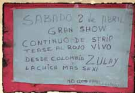
This sign on a strip club in Ecuador announces a show with girls from Colombia.

He says to himself, "God has forgotten; he covers his face and never sees."