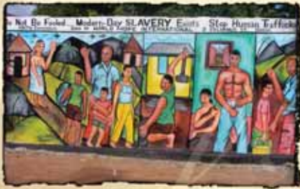
A mural in West Africa warns community residents about trafficking in persons.